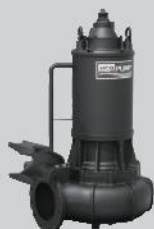
AF-1430 · AF-1440 AF-1650 · AF-1660 (GRS)