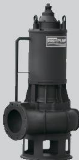
AF-1430 · AF-1440 AF-1650 · AF-1660 (Standard)