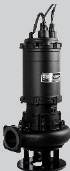
AF-840 · AF-850 · AF-860