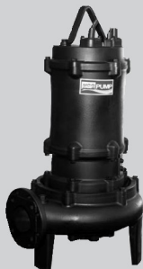
100(150)AFE422 · 100(150)AFE430