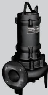
100(150)AFE45.5 · 100(150)AFE47.5